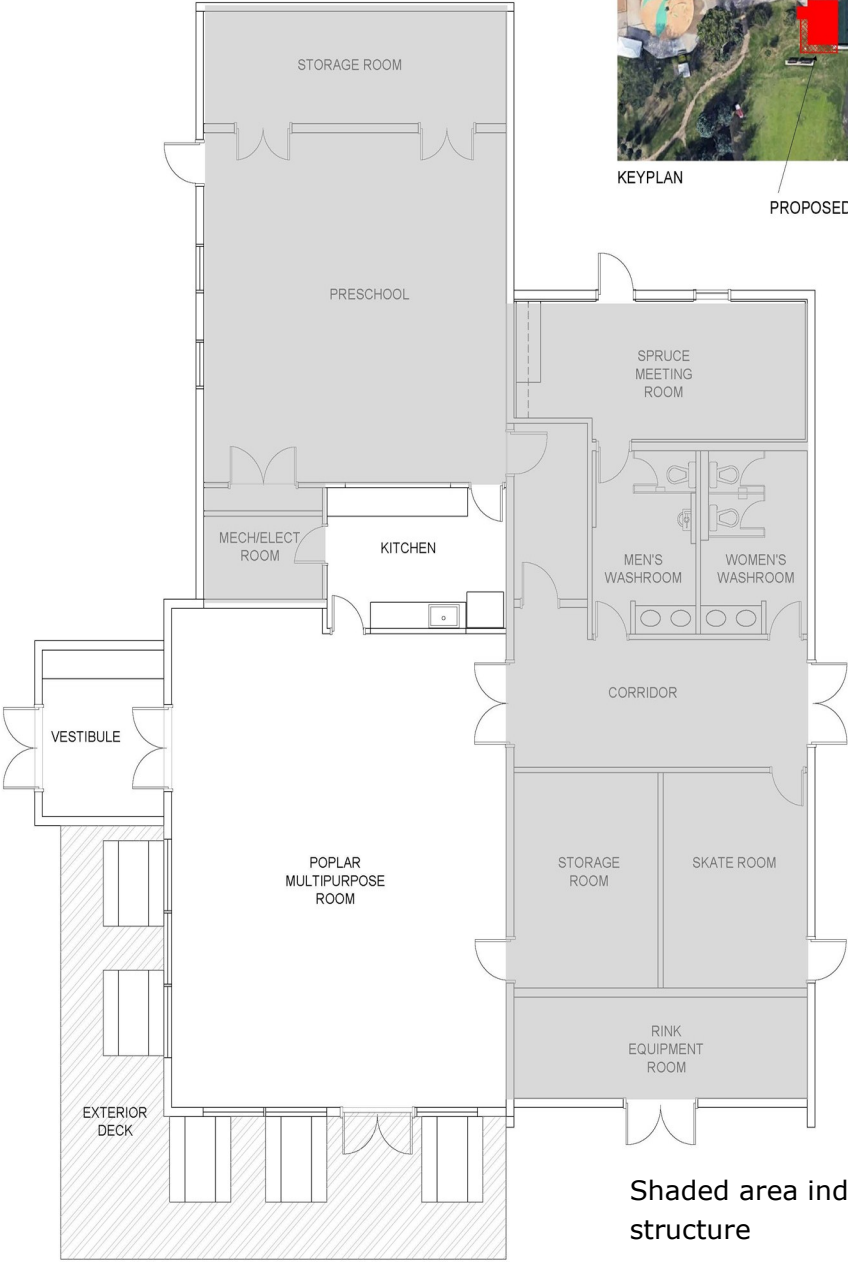
Shaded area indicates existing hall structure